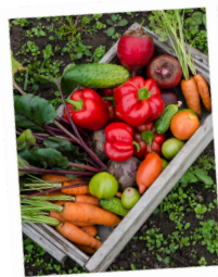
HANDS ON GARDENING