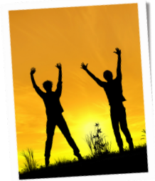
BOYS II MEN