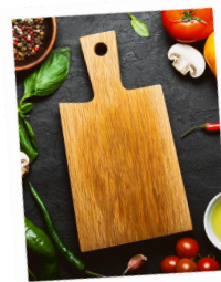
NO BAKE COOKING CLASS