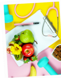
BODY & HEALTH FUN