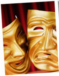
ACTING & IMPROV