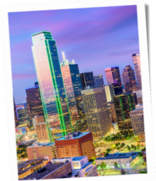
CIVICS IS DOPE