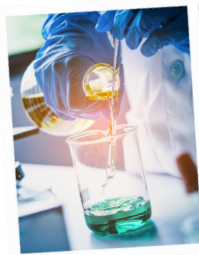
HANDS ON SCIENCE PROJECTS